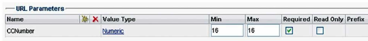
Figure 1: SecureSphere automatically builds a model of each Web application parameter

Figure 1 presents a SecureSphere Dynamic Profile of a "Credit Card Number" parameter corresponding to the appropriate length of the Credit Card number that is entered into an online form of an ecommerce site: